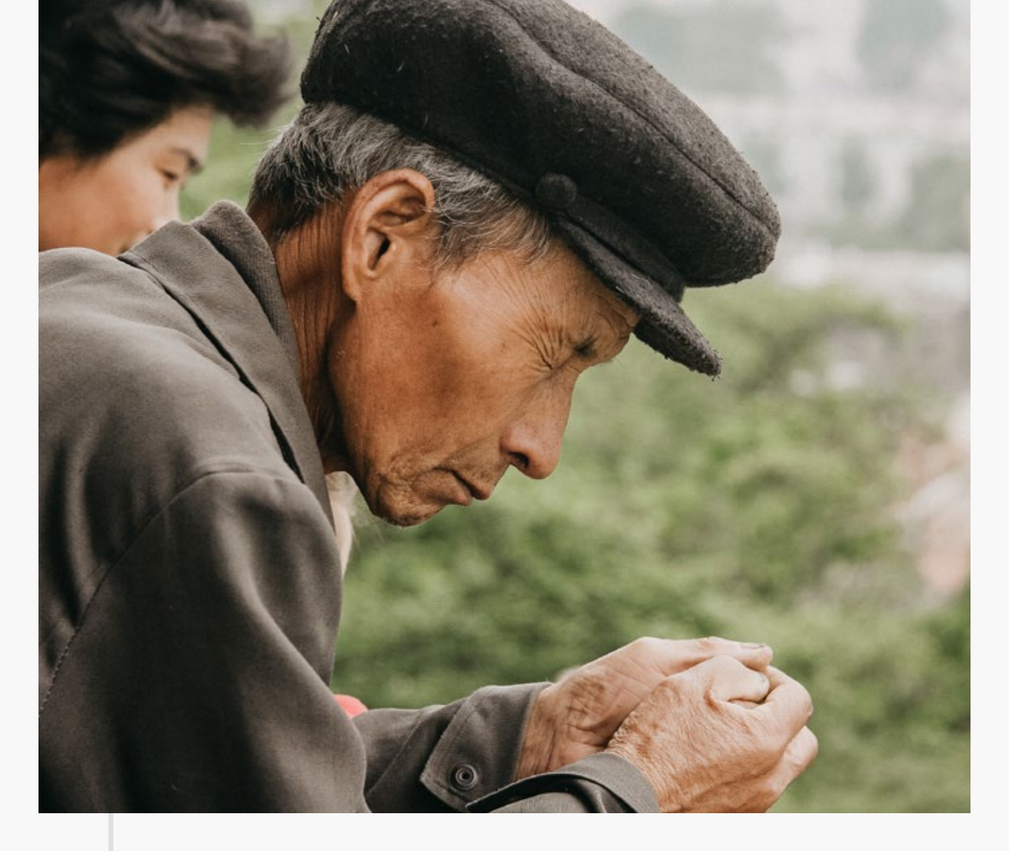
"YOU HELPED LAY A SOLID FOUNDATION FOR A LARGE AND STRONG CHURCH TODAY IN CHINA. THANK YOU FOR WHAT YOU HAVE DONE."