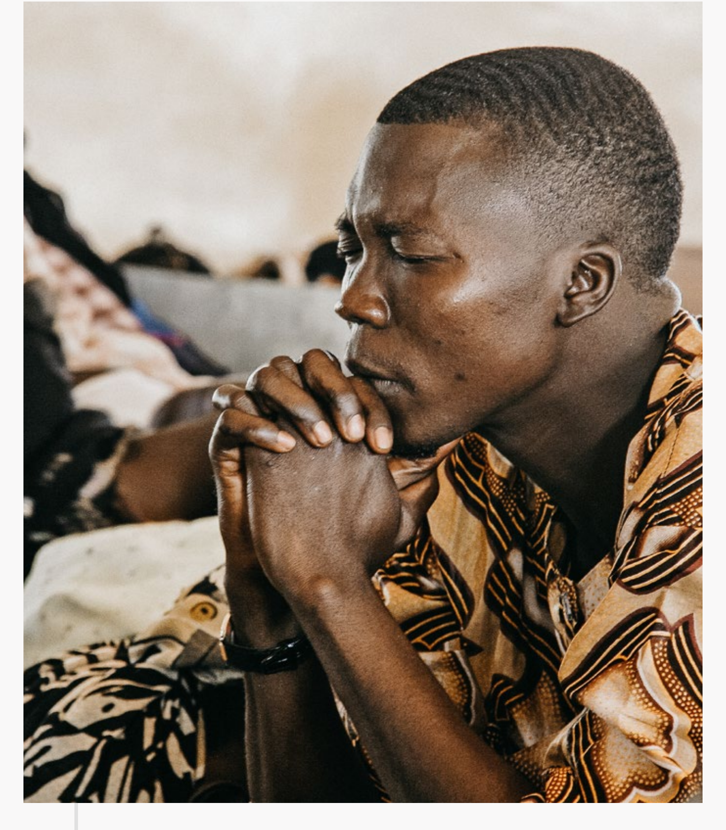
"THIS SUPPORT HAS BROUGHT PEACE TO OUR HEARTS AND FOOD TO OUR TABLES. THANK YOU AND MAY GOD BLESS YOU."